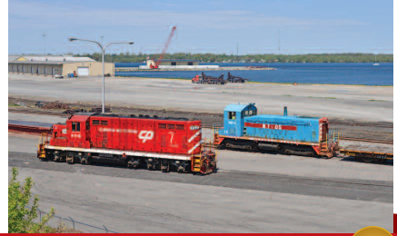
Crews work the Port of Ogdensburg 50

In 2002, the New York & Ogdensburg Railway (NYOG) was the last piece of former Rutland Railway to join the VRS family. Owned by the Ogdensburg Bridge and Port authority, the NYOG extends 29 miles from the Port of Ogdensburg to Norfolk N.Y., serving the port in addition to local industries.