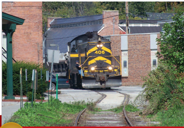
50 Side streets and hills of Barre

The Washington County Railroad's (WACR) Montpelier & Barre Division was next to join the VRS in September 1999. Several granite industries, lumber companies, and a wind generator manufacturer are located on the line that stretches from Montpelier Junction to Graniteville. Trains operate over 14 miles of steep terrain which includes a 5% ascending grade from Barre to Graniteville through a series of spectacular switchbacks.