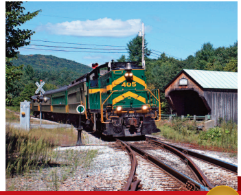
The Green Mountain Flyer 50

access to major carriers such as Norfolk Southern, Providence & Worcester, and the Washington Country Railroad. In addition to being a strategic line for shippers, the railroad offered Vermont's renowned scenery to over 35,000 passengers annually on the "Green Mountain Flyer" between June and October. The acquisition of the Riverside Reload Center in 1997 allowed the GMRC to serve off-rail customers in the lumber, steel, pulp, paper, and aggregate industries. The line's proven profitability combined with Vermont Railway's core maintenance and customer service policies made the GMRC a valuable acquisition to the newly formed VRS.