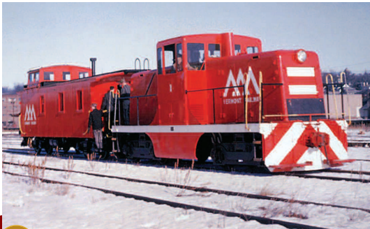
50 #1 prepares to depart Burlington on day 1

In January 1964, the Vermont Railway (VTR) began service over 125 miles of former Rutland Railway trackage from Burlington to White Creek, N.Y., including a 4.5-mile stretch of track between North Bennington and Bennington. Bright Red graced the rails on January 6 as a modest GE 44 tonner and caboose went to work in Burlington Yard on the first day of operations. By the end of the day, it was apparent that VTR's future was as bright as its paint scheme, as plans to add additional motive power were already in place. With daily freights running between Burlington and Rutland, and tri-weekly service between Rutland and North Bennington, VTR set out to restore rail traffic along Vermont's Western Corridor with a strong dedication to customer service.