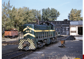
The Rutland nears the end 50