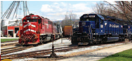
50 Interchanging with Pan Am Southern

Today the Vermont Rail System operates over 350 miles of track with its family of over 125 dedicated railroaders. The railroad hauls over 25,000 cars each year, with nearly 90% of traffic serving Vermont businesses. VRS maintains interchanges with: Canadian Pacific, CSX Transportation, New England Central, Montreal Maine & Atlantic, Pan Am Southern, and Canadian National Railway (via NECR), and also hosts Amtrak's Ethan Allen Express, which runs daily between Rutland, V.T. and New York City. These six interchange points allow customers to effectively utilize