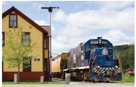
WACR along the Connecticut River 50

It was also during this time that the Vermont Agency of Transportation purchased the 41 miles of railroad between White River Junction and Wells River from Guildford Transportation Industries, and named the GMRC as interim operator in order to rehabilitate the line. Following extensive repairs during the year, train service resumed on the line in February 2000 after a nearly 5-year hiatus. In June 2002, the WACR was appointed to operate